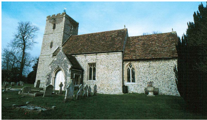
St. Mary's Church, Reed