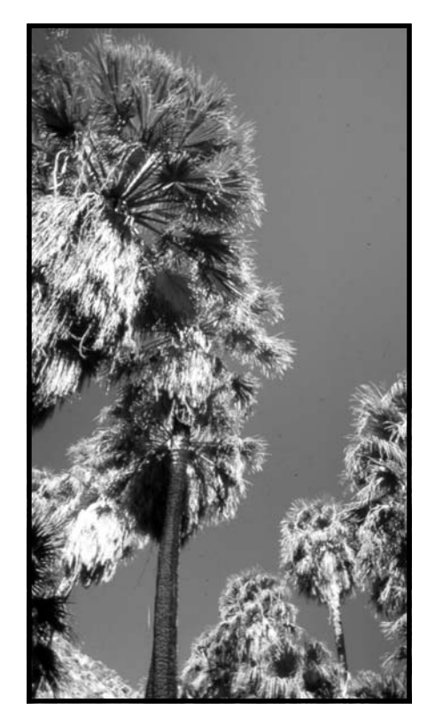
The Palm Canyon Nature Trail is a three-mile round trip walk featuring a native palm oasis.