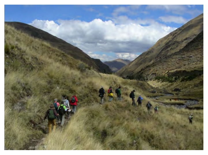
Guests take part in a trekking adventure

The world community has, however, begun to take the crisis seriously: In December 2015, 196 nations attending the COP21 summit in Paris voted to take steps "to limit temperature increase to 1.5 degrees Celsius", and developed countries agreed to create a $100 billion a year fund to help developing countries switch from fossil fuels to greener sources. The agreement has to be endorsed by each of the respective governments.<sup>15</sup>