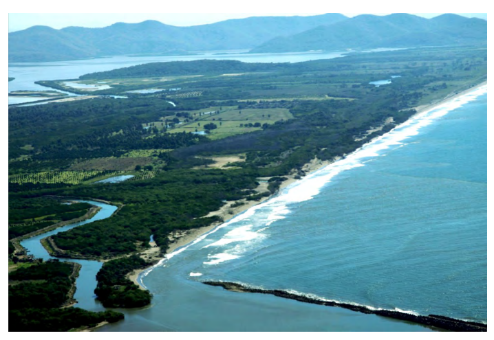
Southern Sinaloa state, Mexico has joined the small group of destinations that have been assessed based on the Global Sustainable Tourism Council (GSTC) criteria.

Ljubljana, Slovenia, was selected for the 2015 Destination Award in the World Travel & Tourism Council's Tourism for Tomorrow Awards. With a strategic sustainable development plan to make the capital city more appealing to tourists, Ljubljana has also become a better place to live for residents. A major effort to limit automobile traffic over the past decade resulted in the increase of pedestrian zones by almost 620%. An ecological zone was created in the city center, and about 46% of the city is forested. "Surveys measure how satisfied locals are with the presence of tourists; and the community is included in the planning process, and regularly informed of developments."70