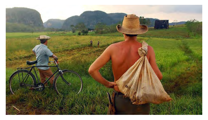
Agritourism grows in popularity as travelers look to experience local life.

Between 1997 and 2007, nature- and agricultural-based tourism was the fastest growing sector of the US travel and tourism industry.<sup>87</sup> Rural tourism growth in Europe is three times greater than the increase in tourism in general.<sup>88</sup>