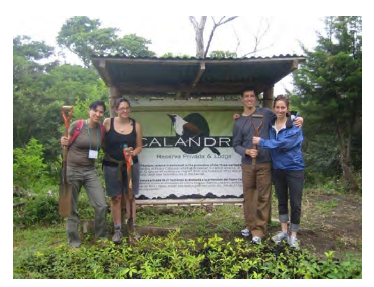
Travelers take part in an environmental give-back project

There is a consensus among specialists that we are currently experiencing a "New Tourism." These new tourists have a higher level of environmental and cultural awareness, which means that, as a result of the generalization of ICTs and social networks, they are more demanding, more able to influence, and have their say on the products that they consume.<sup>33</sup>