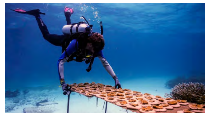
Coral restoration projects combat the loss of coral reefs in the Dominican Republic

2015 research on the impact of TUI Group's tourism operations based around six hotels in Cyprus shows the importance of going beyond basic impact measurements. For instance, tourism tax receipts were found to be a very significant benefit for Cyprus, equivalent to €25 per customer per night. Furthermore, a significant amount of the total impact of tourism was found to come "indirectly" from supply chain activities. Supply chains and other services used by customers generated almost 14 times more waste then the hotels themselves (25kg of rubbish came from the supply chain compared with 1.8kg of rubbish per customer per night from hotels).67