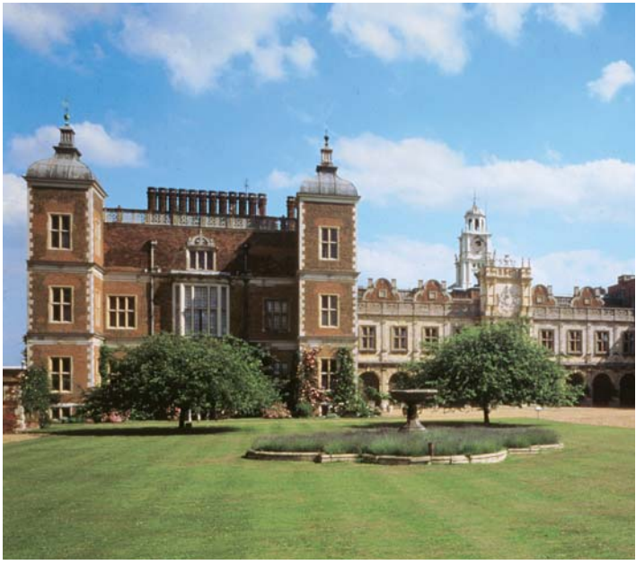
Hatfield House, Park and Gardens