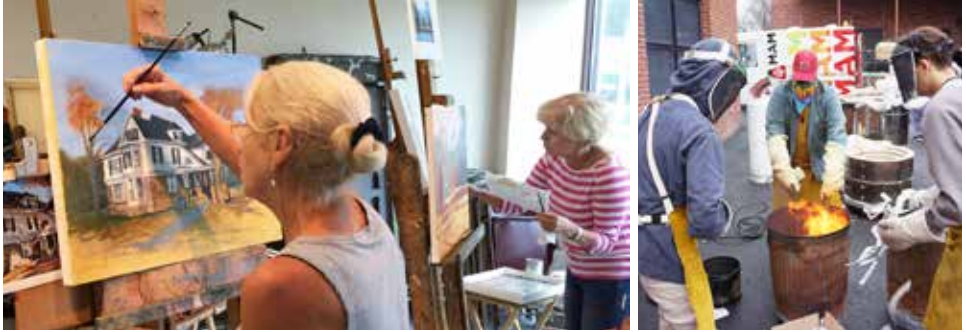
Materials, glazing, and firing included in tuition.